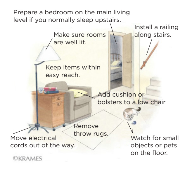
Copyright © 2017 The StayWell Company, LLC