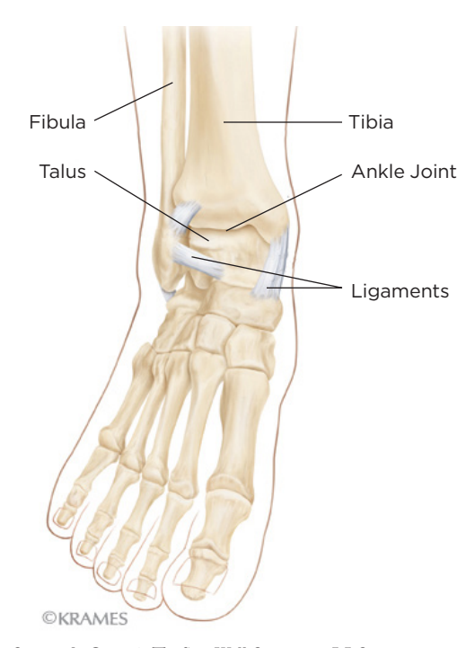
Copyright © 2017 The StayWell Company, LLC.