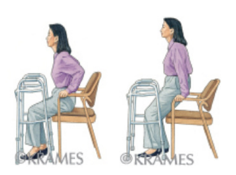
Copyright © 2017 The StayWell Company, LLC.